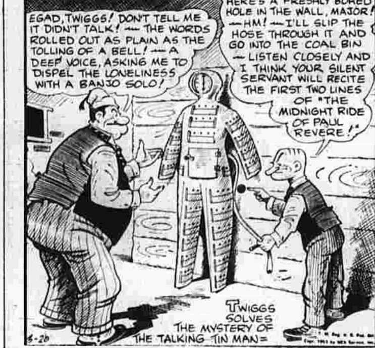
Count Us In, Too