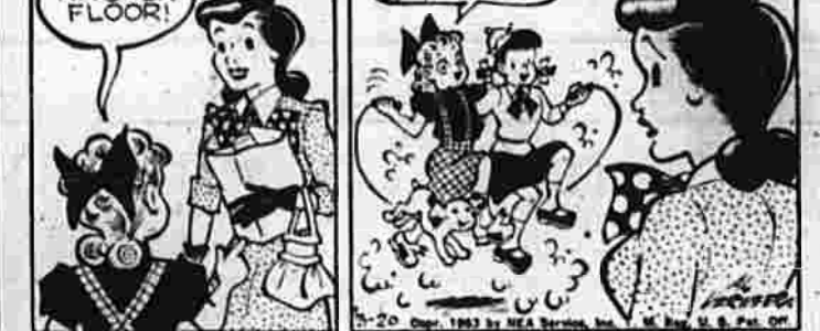
BY RUSS WINTERBOTHAM