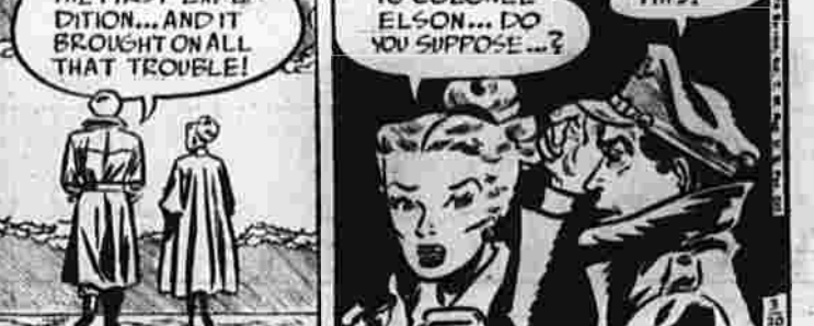
BY RUSS WINTERBOTHAM