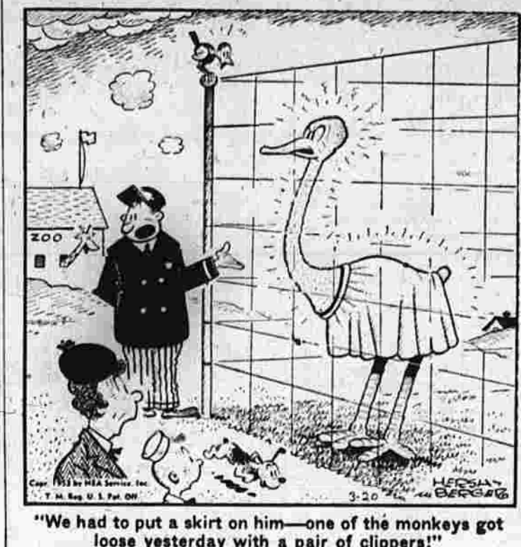
"We had to put a skirt on him—one of the monkeys got loose yesterday with a pair of clippers!"