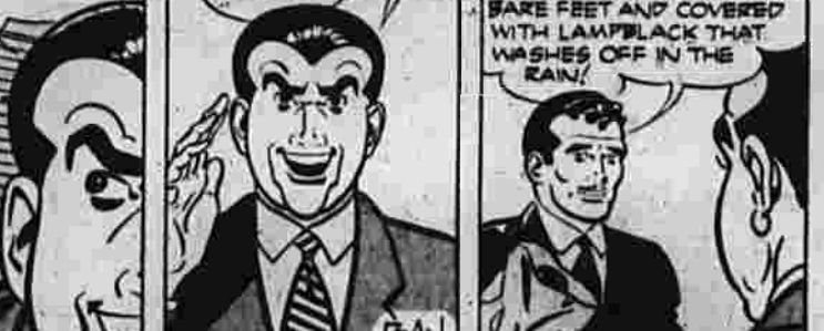
BY RUSS WINTERBOTHAM