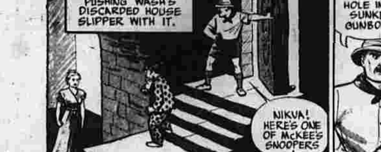
Amalza Has An Idea