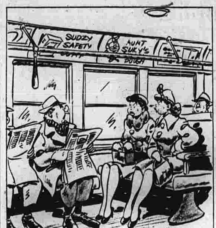
"I don't mind listening to all last night's TV programs, but would you mind leaving out the commercials?"