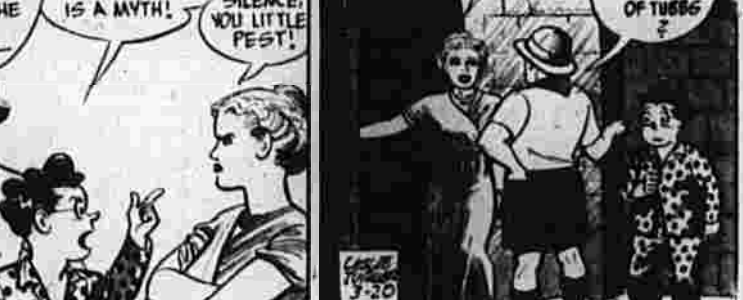
BY RUSS WINTERBOTHAM