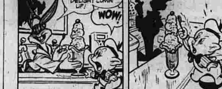
Amalza Has An Idea